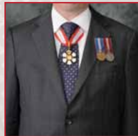
Neck badge and medal bar