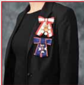
Neck badge and chest insignia mounted on bows