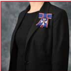
Insignia mounted on bow