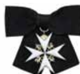
Most Venerable Order of the Hospital of St. John of Jerusalem

Decorations recognize an act of gallantry in combat, or of bravery or meritorious service in a single event or over a specific period of time. The insignia is only awarded once to an individual; if further actions meet the criteria for the same decoration, a bar is awarded and worn on the initial decoration in order to denote a second award.