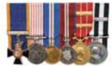
Court Mounting Overlapping Medals