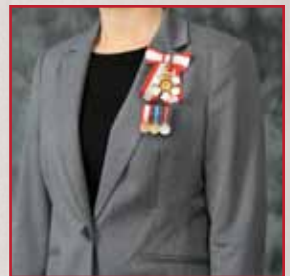
Neck badge on bow and miniatures