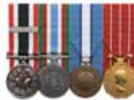
Court Mounting Non-overlapping Medals