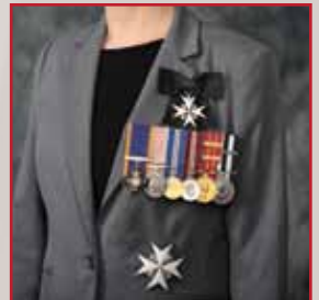
Neck badge on bow with medal bar and breast star