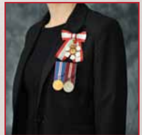
Neck badge on bow and medal bar