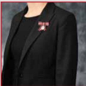
Single miniature on bow