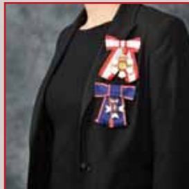
Neck badge and chest insignia mounted on bows