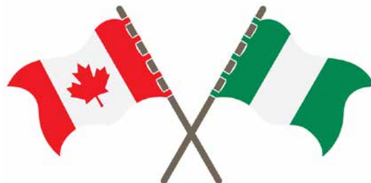
State Visit to the Federal Republic of Nigeria October 28 to 30, 2018