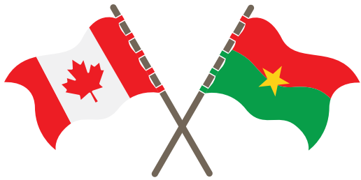
State Visit to Burkina Faso October 23 to 26, 2018