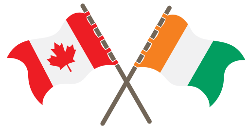
State Visit to the Republic of Côte d'Ivoire October 26 to 28, 2018