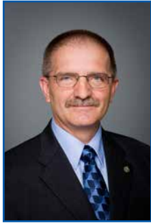
Wladyslaw Lizon Member of Parliament

Wladyslaw Lizon was born and raised in Poland where he graduated from AGH, the University of Science and Technology in Krakow with a master's degree in mining engineering. He worked in Polish coal mines and stone quarries, and was an active member of the Solidarity movement that led to the fall of Communism in Poland and throughout Europe.