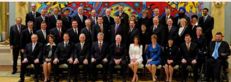
The Governor General presided over the swearing-in of the Canadian Ministry on May 18, 2011, at Rideau Hall.

One of the Governor General's responsibilities is to ensure that Canada always has a Prime Minister. The Governor General presides over the swearing-in of the Prime Minister, the Chief Justice of Canada and cabinet ministers; summons, prorogues and dissolves Parliament; delivers the Speech from the Throne; and gives Royal Assent to acts of Parliament. He acts on the advice of the Prime Minister, but has the right to advise, encourage and warn.