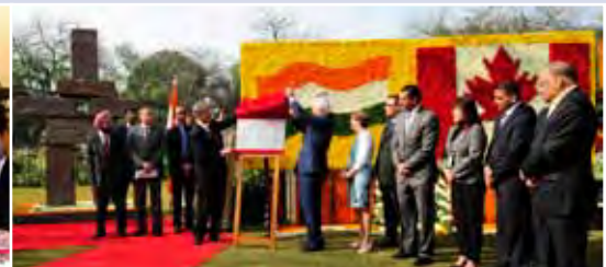
In February, Their Excellencies unveiled and presented an inuksuk to the people of India on behalf of the people of Canada; the gift symbolizes the friendship and co-operation between both countries.

In 2013-2014, the Office supported Governor General David Johnston as he represented Canada abroad, visiting eight countries.