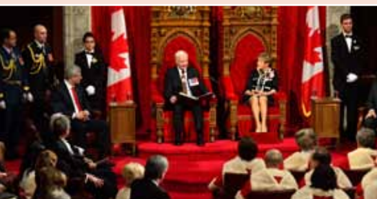
The Governor General read the Speech from the Throne in the Senate on October 16, 2013.