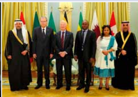
On January 28, the Governor General received the credentials of four ambassadors (Saudi Arabia, Brazil, Ethiopia and Qatar) and one high commissioner (Uganda).

“Since becoming Governor General, I have received many credentials and have had the good fortune to meet with representatives from countries all over the world. I am always fascinated by the fact that, despite differences of culture or language, we can all find something in each other that strikes a common chord. This is essential to the practice of diplomacy.”