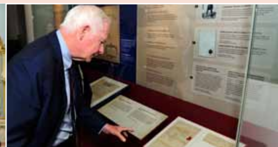
The Governor General had the opportunity to examine the Royal Proclamation of 1763, which was on display at the Canadian Museum of Civilization, in October.