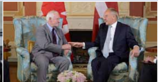
In September, as part of a working visit to Canada, His Excellency Andris Berzinš, President of the Republic of Latvia, met with the Governor General.