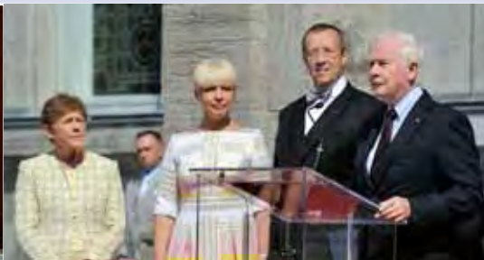
In May, His Excellency Toomas Hendrik Ilves, President of the Republic of Estonia, and Mrs. Evelin Ilves, began their State visit to Canada.