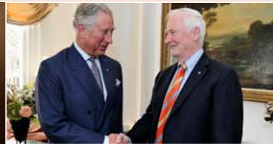
In April, while in Amsterdam to attend the investiture ceremony of His Majesty King Willem-Alexander, His Excellency met with His Royal Highness The Prince of Wales.

In 2013-2014, close to 100 activities associated with representing the Crown in Canada were supported by the Office.