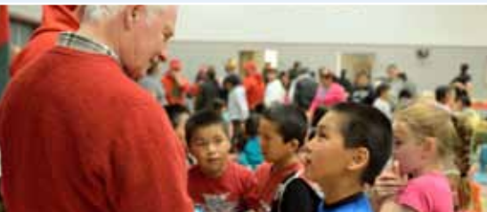
In June, His Excellency attended a community gathering at Amos Comenius Memorial School in Hopedale, Newfoundland and Labrador.

The Governor General participates in commemorative ceremonies and national celebrations, provincial and territorial visits, and community activities across the country. He also hosts events at both official residences: Rideau Hall in Ottawa, and the Residence of the Governor General at the Citadelle of Québec.