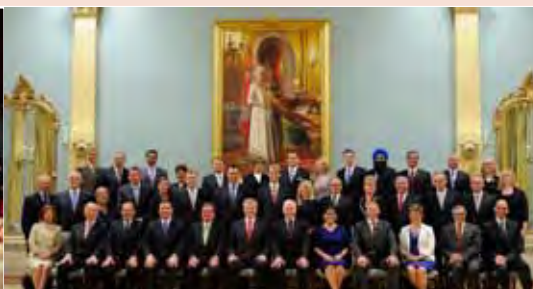
On July 15, 2013, His Excellency presided over the swearing-in of the Canadian Ministry.