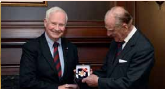
During a visit to Toronto in April, His Excellency presented the insignia of Companion of the Order of Canada to His Royal Highness The Prince Philip, Duke of Edinburgh.