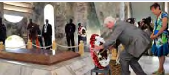
In May, Their Excellencies paid homage to the late Dr. Kwame Nkrumah, former president of Ghana, by laying a wreath at his tomb.

The Governor General represents Canada at home and abroad, receiving visiting heads of State, conducting State visits abroad, accepting the credentials of foreign heads of mission and signing diplomatic documents.