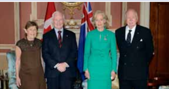
Their Excellencies Quentin Bryce, Governor-General of Australia, and Mr. Michael Bryce visited Canada at the beginning of April.