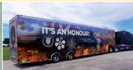
The It's An Honour! mobile exhibit began travelling across Canada on July 31. Made possible by the generosity of The Taylor Family Foundation, the exhibit features interpretative panels, multimedia elements and artifacts, providing an opportunity for visitors of all ages to learn more about the Canadian Honours System and some of its recipients.