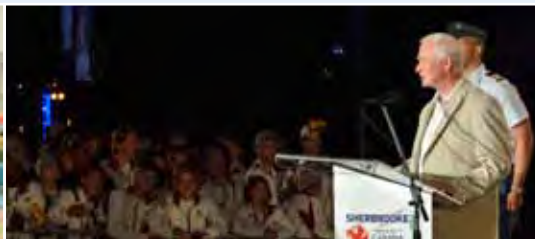
In August, the Governor General officially closed the 2013 Canada Summer Games in Sherbrooke, Quebec.