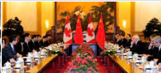
In October, the Governor General met His Excellency Xi Jinping, President of the People's Republic of China, and discussed issues of mutual interest to both countries.